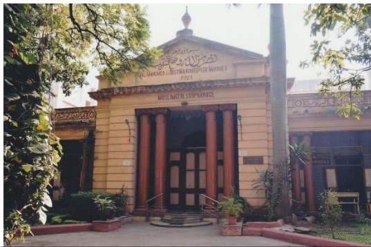
MUSLIM GIRL'S ORPHANAGE

Later, in 1960, its sole trusteeship was transferred to Anjuman-I-Islam of Mumbai. It is a very big educational organization having many institutions catering to various educational courses all over Maharashtra. The aim of both these campuses is - "बेटी बचाओ, बेटी पढ़ाओ और बेटी बसाओ".