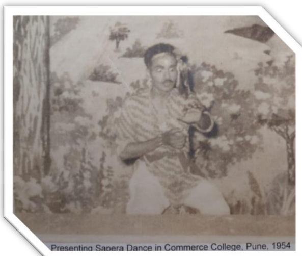
Presenting Sapera Dance in Commerce College, Pune, 1954