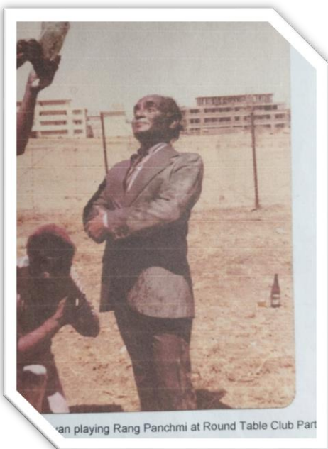
an playing Rang Panchmi at Round Table Club Part

Playing rang Panchami at Round Table Club Party